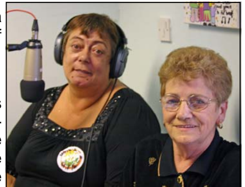
Local residents volunteer at Rhys Radio

us at Canolfan Rhys Arts and Education Centre, Heol Dyfed Penrhys, CF43 3PT or telephone 01443 755580.